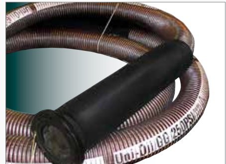
Hose coiled and placed on pallet; ready for shipment