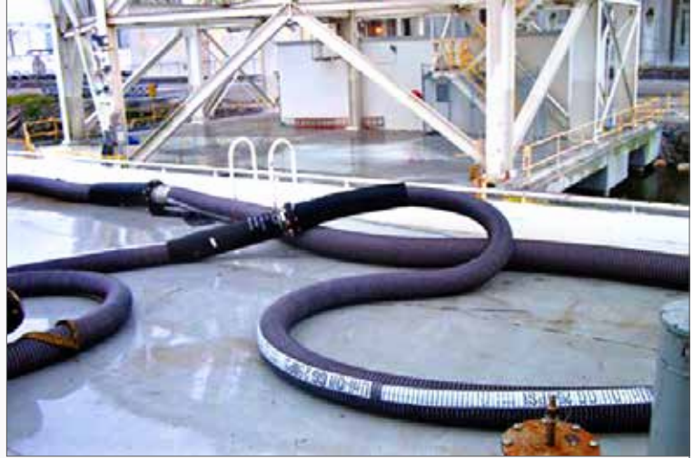
Hose in service: Note the gradual bend achieved off of the horizontal connections