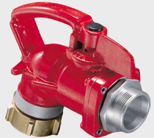
Male/female fuel nozzle