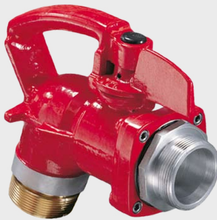
Male/male fuel nozzle