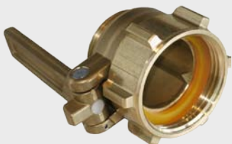
TODO-SNAP lug nut