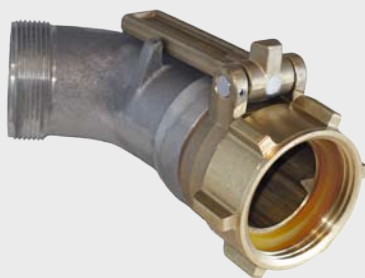
TODO-SNAP lug nut with 45° bend