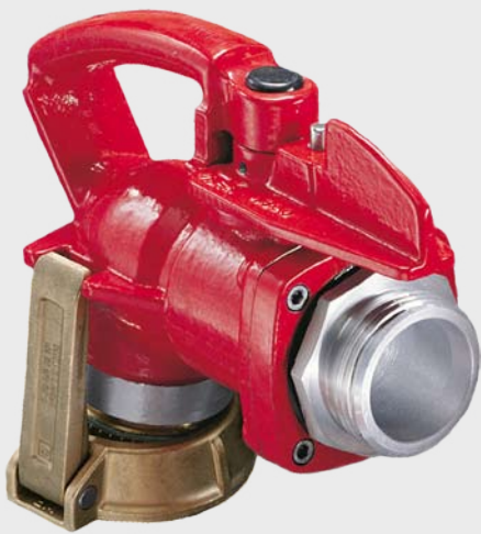
TW fuel nozzle