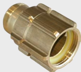
Outlet with extra long swiveling lug nut